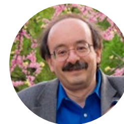
Mr Amory Lovins (Rocky Mountain Institute) Exclusively taped video lecture for the occasion of Springtide Academy